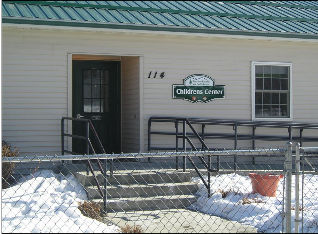
Beartooth Children's Center, Red Lodge