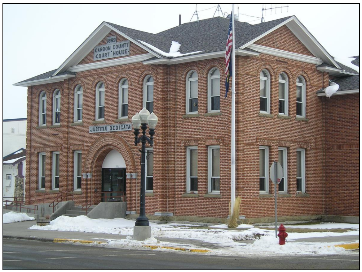
Carbon County Courthouse, Red Lodge