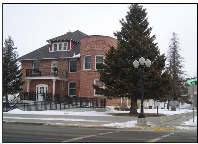
Carbon County Annex Building, Red Lodge