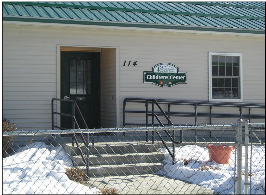
Beartooth Children's Center, Red Lodge